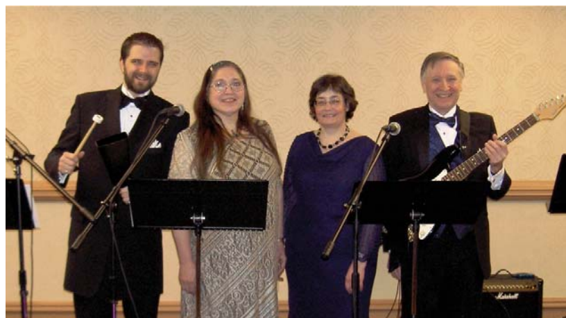
Freethought Vocal Ensemble provides entertainment for attendees.