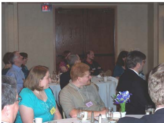
Members and Guests attend to the proceedings