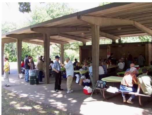
Members and Guests eat, talk and mingle!

As an unexpected addition, a non-profit organization, Girls with Media, heard about the picnic and showed up to videotape a roundtable with members from the various freethought organizations for a film they are making on different faith (and non-faith) affiliations in Minnesota. (The organization works with high school girls who are interested in cinematography.)