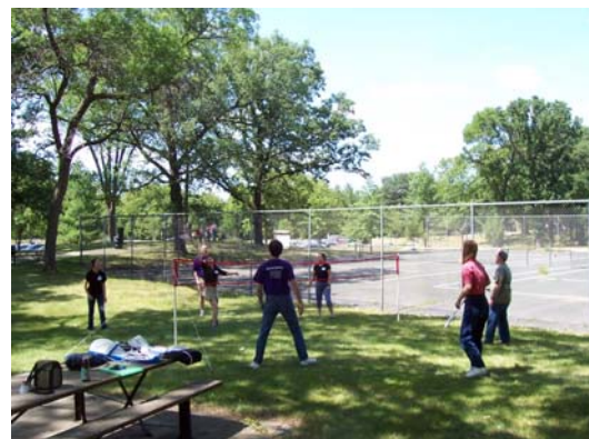
Badminton proves to be a big hit! (Watch that birdie!)